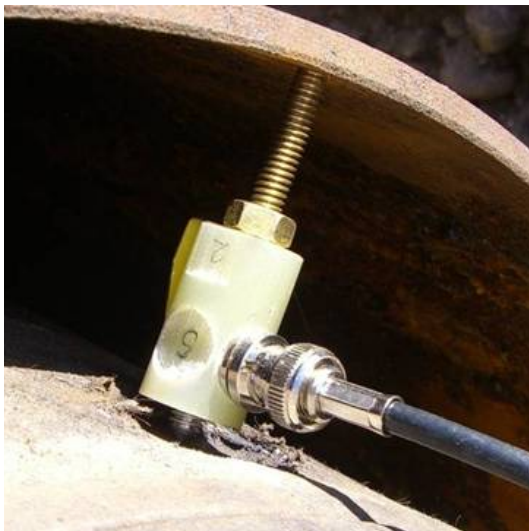
Figure 2a: EMW Injector for Time