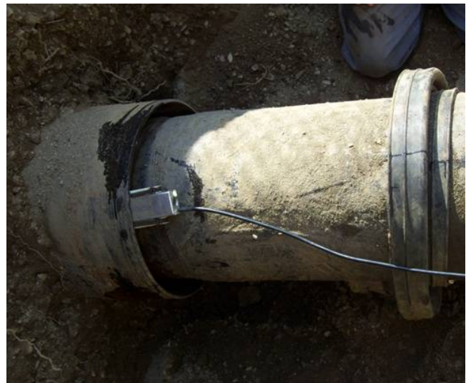
Figure 3: Field Demonstration of the Casing Camera Inspection System

Project funders continue to have the ability to request demonstrations of other technologies as new methods for cased pipe testing emerge.