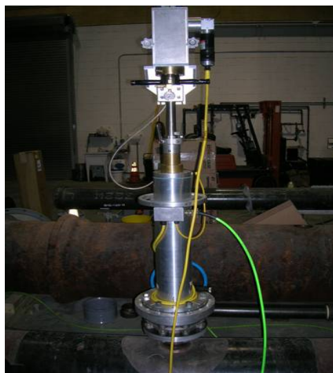
Figure 3: Launch Tube Setup

inspection of steel and cast iron pipelines. SVGC's unique design will allow it to enter and exit a pipe through a 3" taphole using standard drilling and tapping equipment (Figure 3). To assure safe operation during inspections, all work tasks are performed under no-blow conditions throughout the entire process.