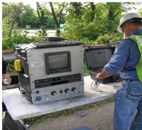
Figure 4: Controls with Video Monitor

The SVGC system design including the crawler device, launching and control system has been completed and is commercially available as a service through ULC Robotics ( www.ulcrobotics.com ). To date, ULC Robotics has successfully inspected a variety of pipelines (cast iron and steel) for several natural gas companies.