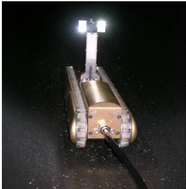
Figure 2: Small VGC in Operation

The inspection system has a specially designed entry and receiving system that has the ability to operate in natural gas pipelines operating at pressures up to 100 psig. An onboard state-of-the-art camera system is able to produce and archive detailed video images for internal