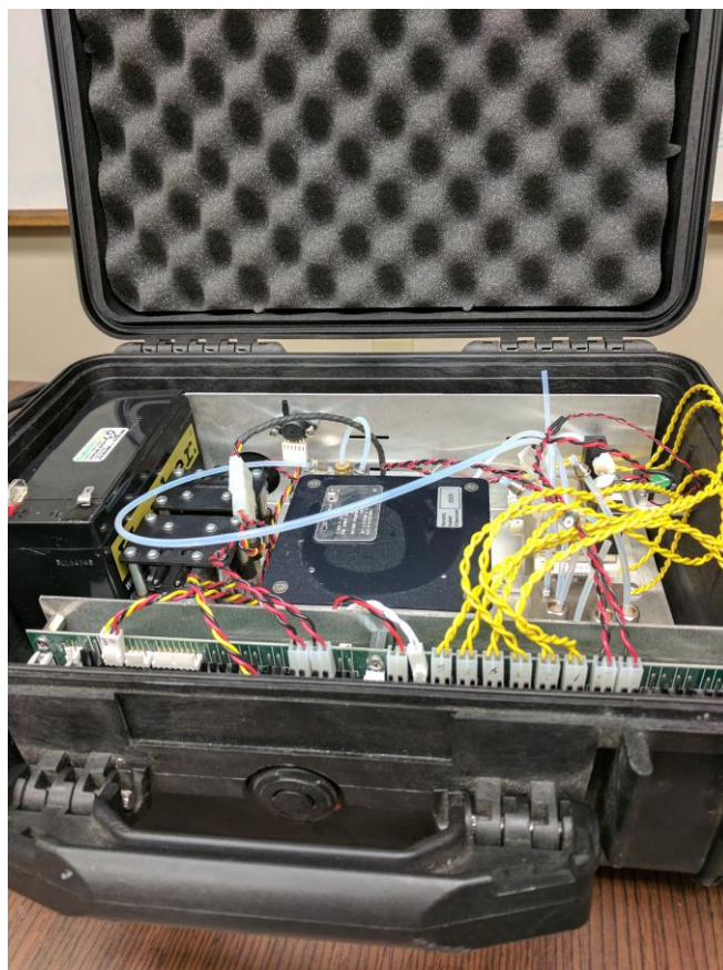
Figure 3. Engineering prototype of metal oxide nano-sensor integrated system with pre-concentrator

In Phase II, the integrated sensor system was further optimized by reducing the number of sensors and integrating different activation temperature set points to heat compounds without affecting sensitivity, selectivity, and discrimination power. Relative limits of detection were also optimized, while the introduction of a pre-concentrator to lower the relative detection limits is showing promise.