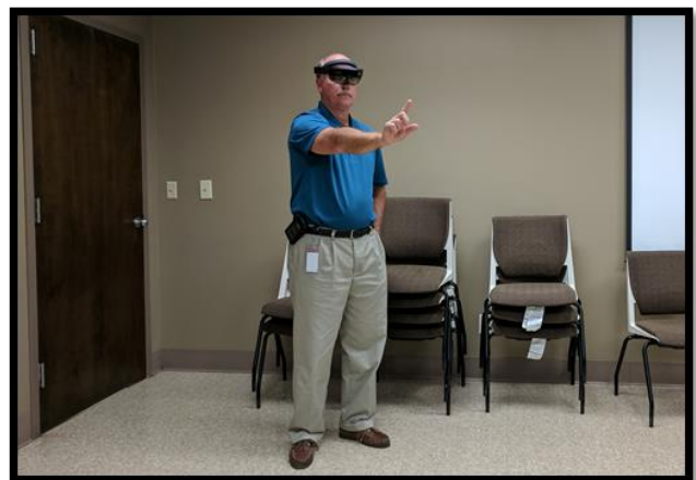
Figure 2. The HoloLens in action

For more information contact: admin@NYSEARCH.org