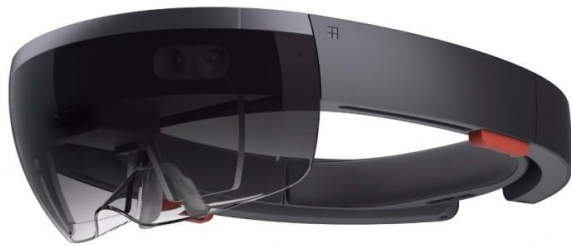
Figure 1. Microsoft HoloLens

Augmented Reality (AR) and Virtual Reality (VR) have swept innovation into various industries in recent years. The technology provides a creative solution to add efficiency in workflow and numerous ways to optimize business operations. AR and VR implementation have proven to increase productivity within workforces across industries.