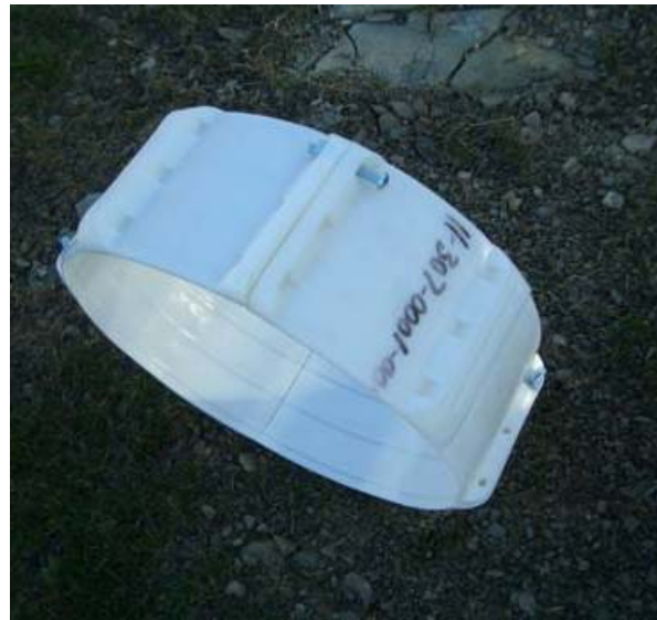
Figure 2a: Modern Casing Spacer

The feasibility study is underway to test concepts for accessing the annular space through a casing vent. The study examines mobility enhancement concepts that enable the propulsion of the video camera. Maneuverability of the camera through pipe fittings encountered in typical vent pipe configurations and past casing spacers is also being tested.