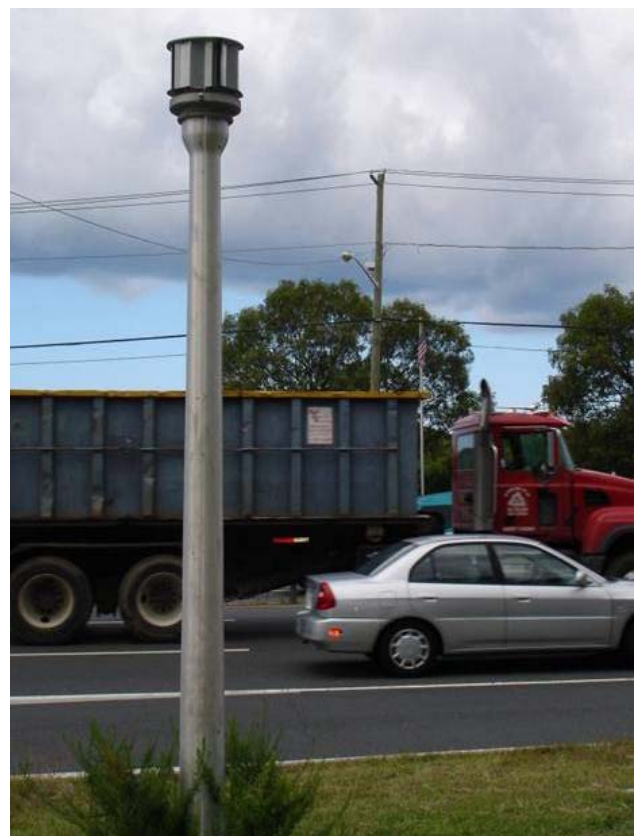
Figure 1: Urban-Style Cased Pipe Casing Vent

inspired NYSEARCH and ULC Robotics to develop a tethered robot with a video camera and dedicated sensors designed for inspections via the annular space of a cased pipe. While this approach continues to be valuable and attractive, a pre-inspection for feasibility of inspection is also desired by some members. Pre-inspections and subsequent use of the casing robot require excavation and removal of the casing end seal. Integrity engineers have suggested that even a limited robotic video inspection via the casing vent pipe (Figures 1 and 1a) could help prioritize the casings for further inspection with other technologies.