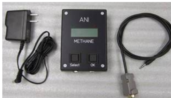
Figure 1: Prototype Methane Sensors

sensor, developed for certain manufacturing applications, was adopted to natural gas applications. These sensors utilize micro-resonator technology to measure the viscosity of gases. Prototype units (see Figure 1) have been built successfully and extensively tested in the