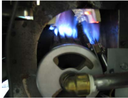
Figure 3: Dearborn Furnace Flame

In the laboratory testing phase, appliance testing was conducted in three steps; each step focusing on different states of adjustment that included: 1) as-received condition from the field, 2) problematic appliances were tested with a typical range of adjustments (e.g. air adjustment) and 3) specific appliance performance problems were diagnosed and corrected and then tested over full gas composition range. In each case, the appliances were tested over a full gas composition range. Examples of tests are illustrated in Figures 2 and 3; Figure 2 representing a stove-top and Figure 3