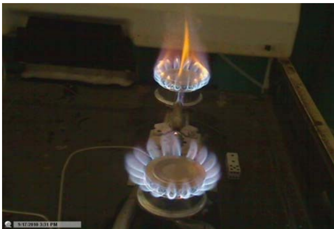
Figure 2: Stove-top Flame Variations with Wide-Ranging Settings.

In the Phase 2 effort, the funding group selected (14) different gases to include in the testing. These are representative of traditional supplies, unconventional supplies (including shale gas, coal-bed methane, and LNG), stretch gases having compositions that extend beyond the range of expected deliveries, and several gases constructed to evaluate analytical methods for assessing interchangeability. The latter gases are two-component blends that could also serve as limit gases in possible future appliance certification tests.