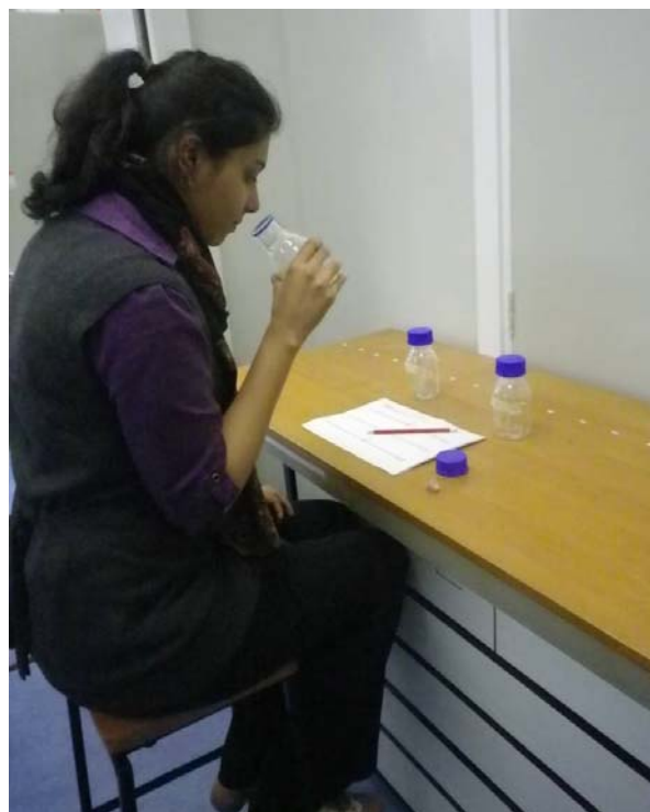
Figure 1: Sample Sniff Test in Cardiff Lab

The vision for the overall NYSEARCH program in this area consists of three phases of work with Phase I focused on identifying the causes of odor masking and the constituents involved. Phase II envisions development of a specific and more refined list of odor masking agents and Phase III targets the operator goal which is to enhance safety by using results from Phase I and II to develop guidelines that mitigate odor masking. In discussions with funders of the Phase I project, it was highlighted by some member participants that odor masking questions could become more prevalent based on introduction of new gas supplies and more diverse trace constituents coming from different gas production processes and supplies.