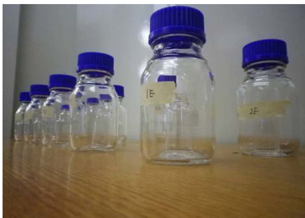
Figure 2: Sample Chemical Pair Test Setup

The goals of Phase I are to study and specifically define the basis for odor masking that is unique to the gas industry's use of mercaptans and to measure the degree of masking that occurs. The contractor differentiates the Phase I work as a "psychophysical approach" rather than a quantitative and cognitive study. In Phase I, Cardiff University team members are conducting systematic testing on numerous sponsor-driven chemical pairs using a panel of randomly-selected human assessors. Using a visual-analog scale that does not require cognitive assessment by the volunteer, as illustrated in the Figure 2, the subject will evaluate the intensity and hedonics (pleasantness) of separate components of "conjugate pairs" (chemicals of interest that are suspected to cause one of the three types of masking listed above), counteracting agents and selected thiols (the name for the compound class