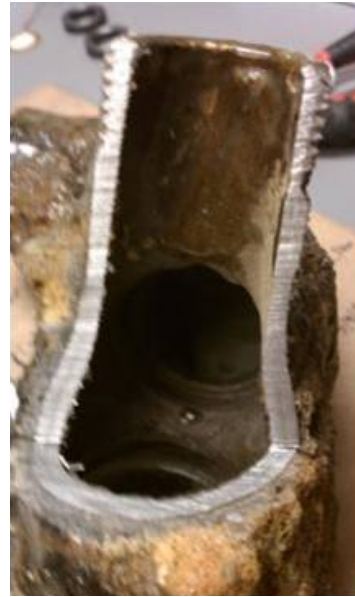
Figure 3: Cutaway View of a Test Service Tee After Adhesive Application

Funding companies have supplied the TTC laboratory with decommissioned service tees. TTC tested multiple sealants for application, adhesion and sealing performance (Figure 3). Laboratory test results of the sealants are under funder review. TTC has recommended moving forward with an adhesive sealant and stent combination. Mechanical delivery methods of the sealant and stent are in the conceptual phase and are being prepared for funder consideration.