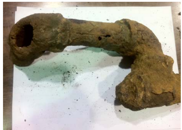
Figure 1: Decommissioned Service Tee

Since the 1990s, when previous research was completed, technical advancements of sealant and adhesive materials have largely improved.