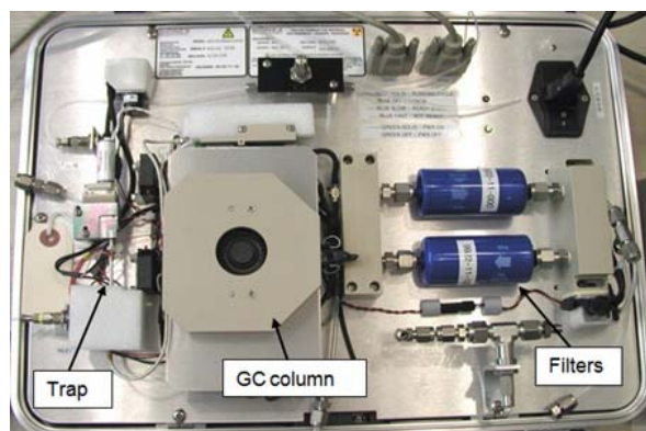
Figure 2: Laboratory Prototype Mercaptans Instrument

in order to optimize the various components and design critical components. In an on-going effort, an engineering prototype is being built which, upon completion of a complete set of laboratory studies, will be tested in the field by NYSEARCH member companies. Field testing is expected to be initiated by the end of 2011. Upon successful completion of the field tests, commercialization of the technology will be undertaken.