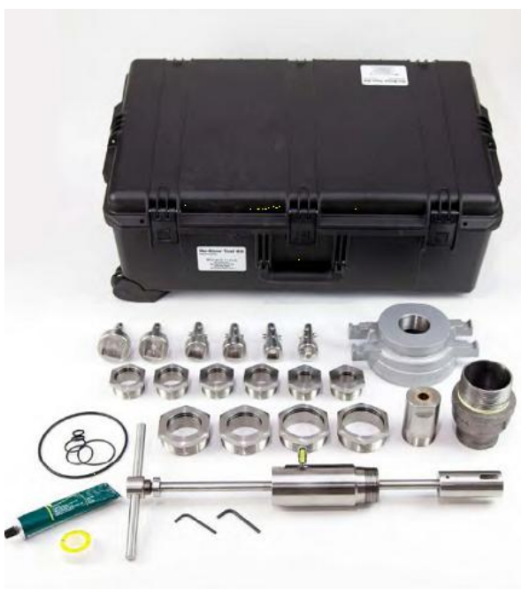
Figure 1: No-Blow Tool Kit

Methane is one of the greenhouse gases which contribute to global warming and is thought to be responsible for nearly as much global warming as all other non-CO 2 greenhouse gases combined. Eliminating venting or blowing gas can help to reduce the carbon foot print and improve the environment by lowering levels of GHG emissions.