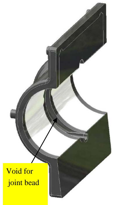
Figure 2: BFRS Void Area

The BFRS fitting allows for a joint repair to be made without interrupting gas service. The fitting is comprised of PE100 material that can be electrofused to all PE pipe materials. The special design has an internal channel to accommodate the external bead of the butt fusion joint. This eliminates the need to physically remove the bead during the repair process (Figure 2).