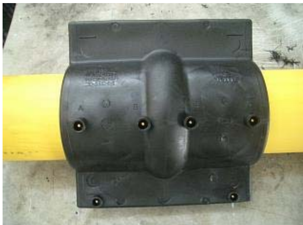
Figure 1: BFRS Installed on PE80 Pipe

NYSEARCH is designing, developing and testing a repair fitting for PE butt fusion joints with a manufacturer, NUPI-GECO Systems of Italy. The split-type repair sleeve, also known as BFRS (Butt Fusion Repair Sleeve), provides a 360° electrofusion repair around the entire circumference of the pipe. Although statistics show that butt fusion joint failures occur infrequently in the field, questionable joints are encountered during routine work that do not meet existing visual examination guidelines. The only repair that can be made, other than using mechanical fittings, is to physically remove the butt fusion joint(s) in question. To accomplish this, a pipeline shutdown is typically required (flow interruption) to remove the joint. This is a costly and time consuming process that requires additional excavations, specialized equipment and, at times, disruption of gas service to customers. The BFRS fittings provide a permanent lower-cost repair option and improve overall safety to gas company operators and the general public (Figure 1).