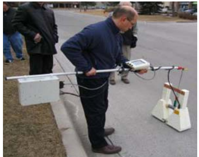
Figure 1: Demonstrating Prototype GPR Bistatic Antenna

construction crew check tool used strictly for on-site markout of facilities. The tool is targeted to be portable, operable by one field person, address facilities of a wide range of materials ranging in diameter size of ½” to 30”, and provide high accuracy. Through its prior work and evaluation of ongoing projects, the committee acknowledged that, unlike current and recently commercialized pipe location devices, a handheld tool must make a quantum leap and overcome a collection of technical barriers such as: use of a free floating antenna that does not require contact to the ground, is low cost, is low in weight and is low in power requirements, and provides data easily useable by a technician.