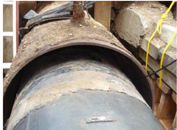
Figure 1: Cased Pipe Exposed for Test

unpiggable and are considered difficult or impossible to qualify as candidates for hydrostatic pressure testing due to ramifications of gas supply interruptions. In addition, Direct