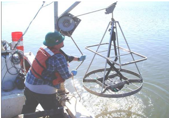
Figure 1: Ponar Grab Sampler for Retrieving Sediment Samples

This alliance was established to develop and evaluate site-specific measures of contaminant bioavailability for sediment management. The goal of the alliance is to increase the scientific understanding governing chemical exposure and toxicity in sediments. This is accomplished via an ongoing site-specific chemical and biological database which serves as the basis for regulatory guidance on the use of direct chemical measurements of contaminant bioavailability for sediment management. As part of this effort, field sediment samples have been acquired