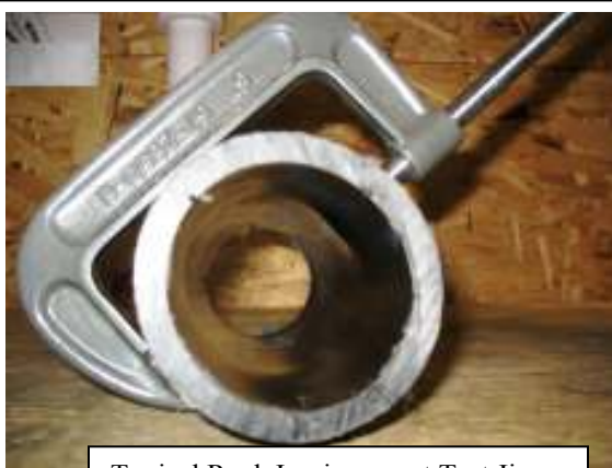
Typical Rock Impingement Test Jig Showing Internal Pipe Deformation