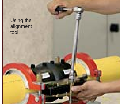
Using the alignment tool.

NYSEARCH member companies provided additional testing over and above ASTM requirements. As a result, it was determined that ERP fittings with the current electrofusion requirements are not acceptable for thin-wall pipe (4-inch DR17 and DR21). GECO Systems is investigating this issue to establish the proper fusion parameters (voltage, temperature and time) needed for DR17 pipe repairs. Although DR17 pipe materials are seldom found in today's gas distribution systems, there may be more opportunities to use these materials with the forthcoming design factor change.