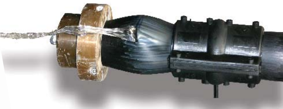
ERP During Hydrostatic Burst Test.